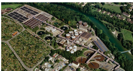
Figure 2: Bird view of Zürich's wastewater treatment plant.

Water quality is assessed by measuring parameters like turbidity (TUR), NH 4 , phosphate (PO 4 ), and chemical oxygen demand (COD). CSEM developed an industrialisation-ready prototype (Figure 1) for contactless measurement, consisting of multispectral imaging with specific illumination that extracts spectral characteristics and machine learning algorithms that predicts water quality. The system includes a UV-sensitive camera and multispectral illumination with 16 bands (250 nm to 940 nm), operated by an embedded computer that pushes data to the cloud for analysis.